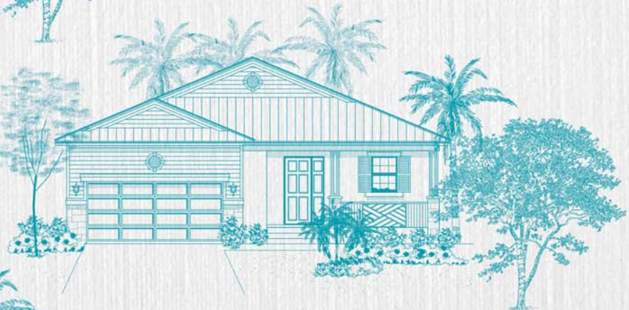
Elevation Option: C