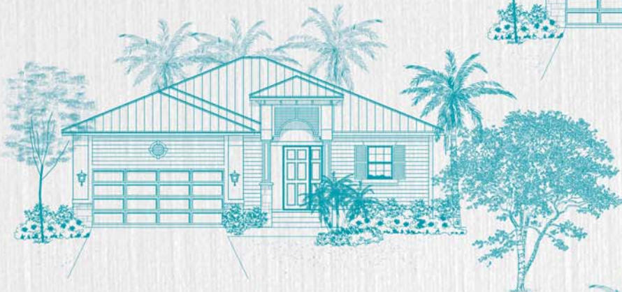
Elevation Option: B