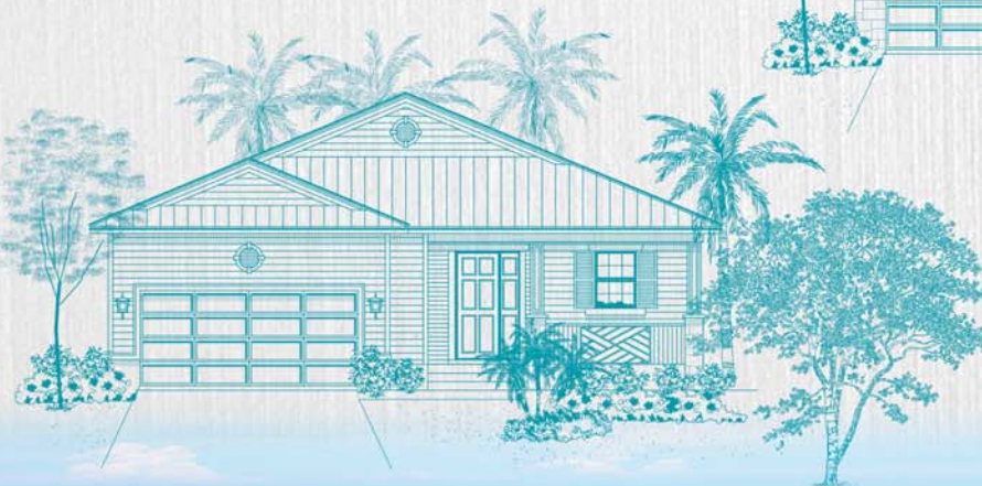
Elevation Option: D

Color renderings and landscaping shown are for artistic purpose only and do not necessarily represent actual color choices and landscaping for home exterior. Elevations shown subject to change. Plans, features and availability are subject to change without notice. Square footages are approximate. Ver: 03/17/18