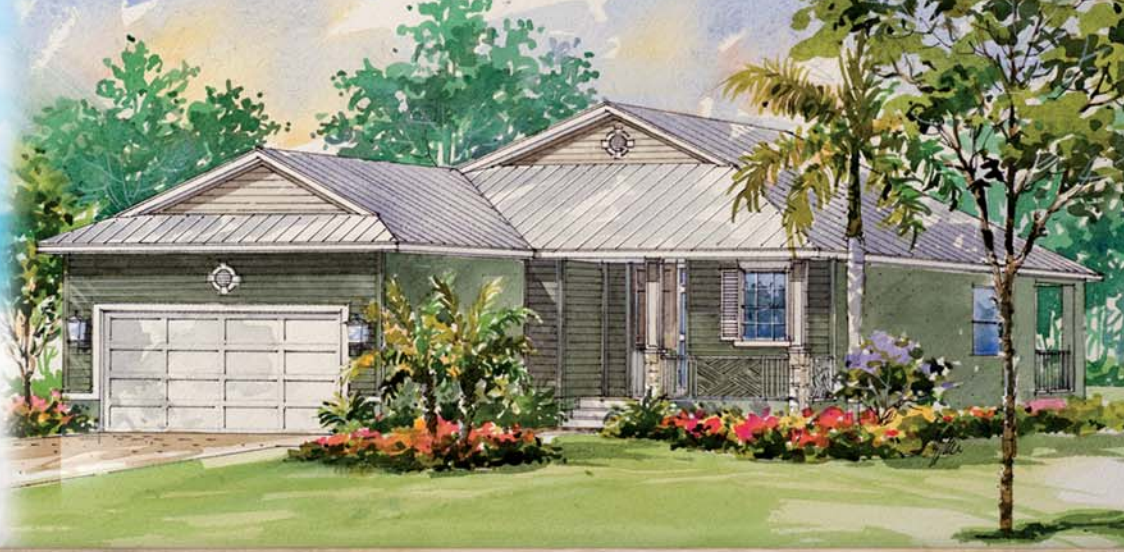
Elevation Option: A